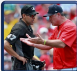
GABE MORALES MLB UMPIRE #47